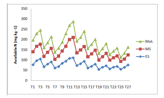
Figure 1: Amount of Available N (mg kg<sup>-1</sup>) in Sonagazi Soil at Different Stages of Growth of Wheat as Influenced by gypsum and Rice-Hull in Association with Alternate Saline Water Irrigation

Physico-Chemical Characteristics of Saline Soil Under Wheat as Influenced by Gypsum, Rice-Hull and Different Salinity Levels